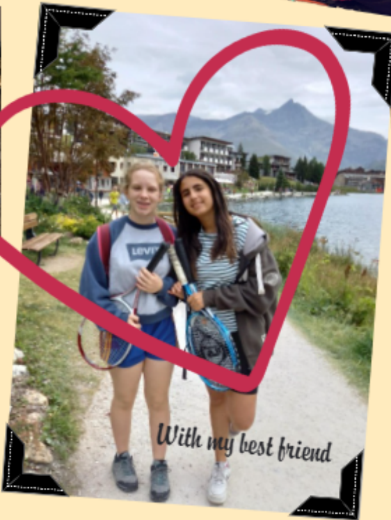
With my best friend