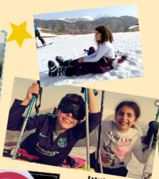
With my brother