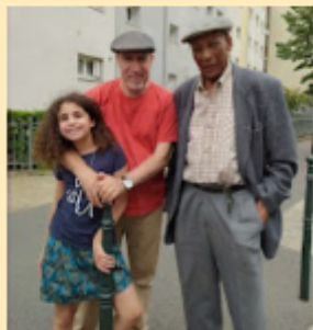
With my maternal grandfather and my paternal great grandfather