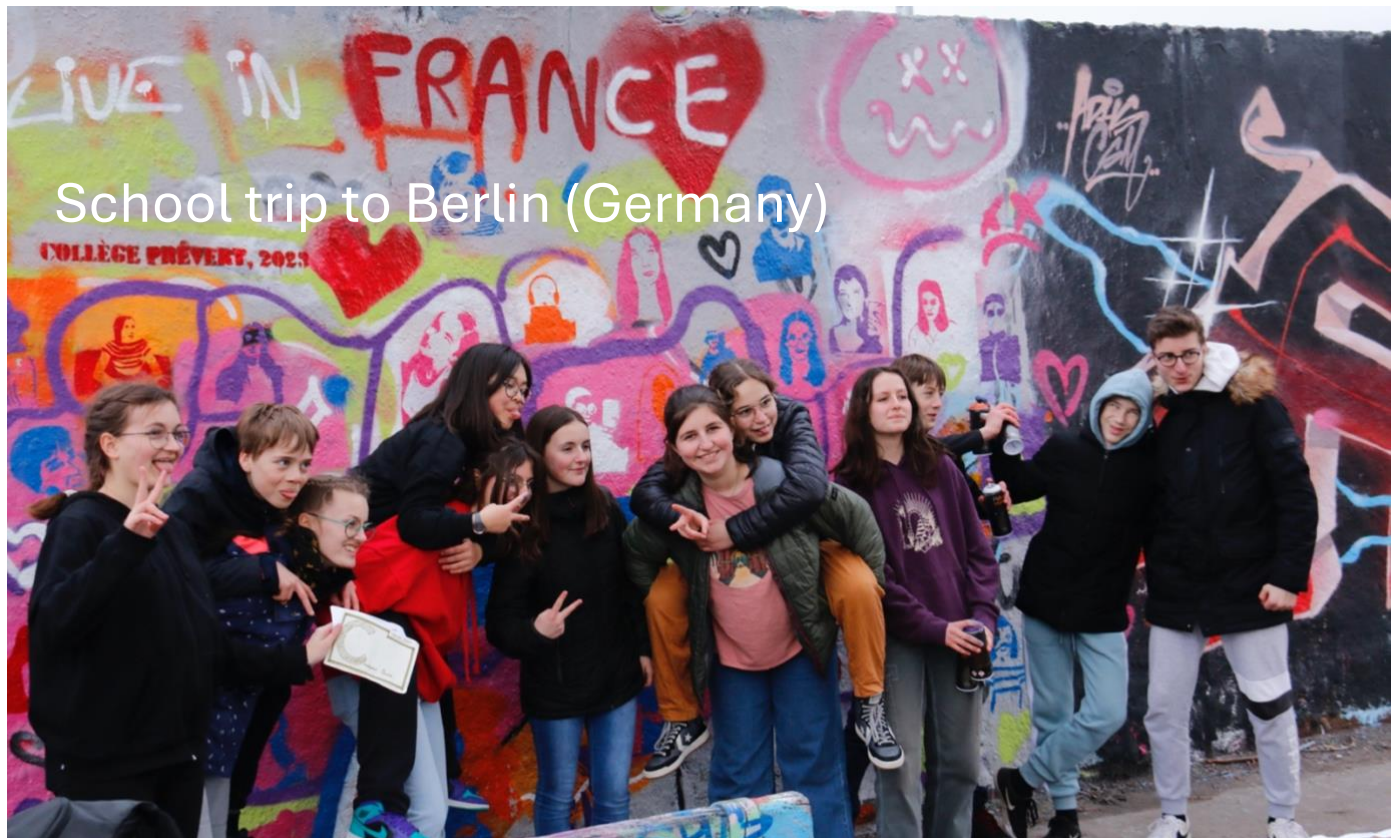
School trip to Berlin (Germany)