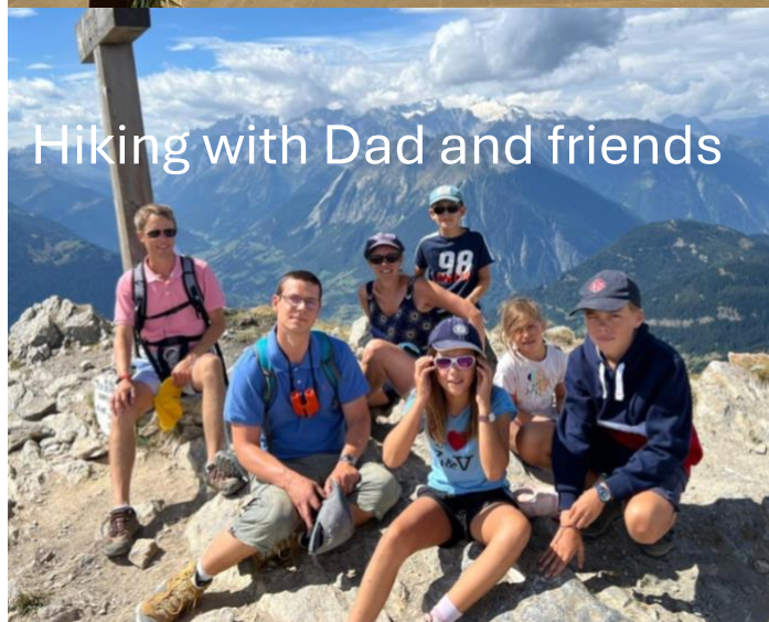
Hiking with Dad and friends