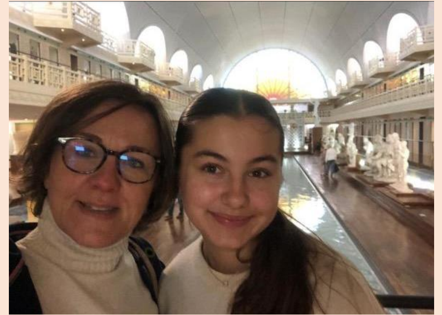
My mother and me in a museum