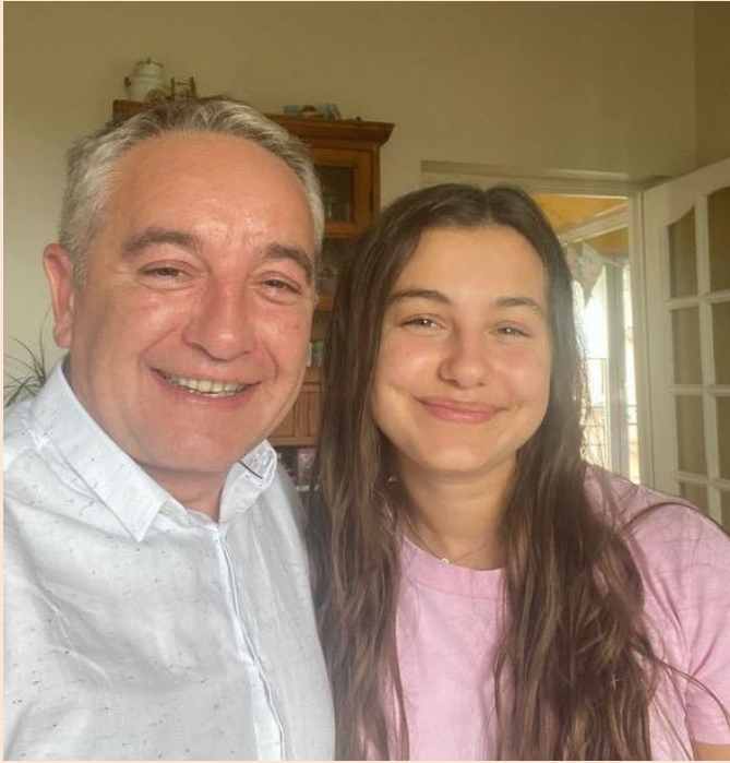
My father and me at home !