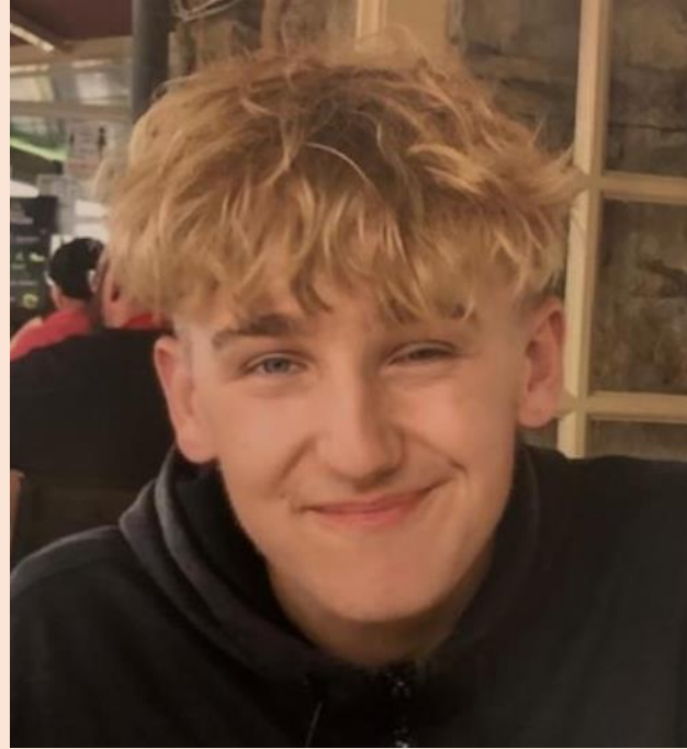
My funny brother