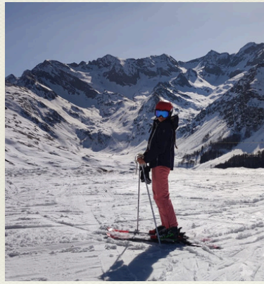
Me skiing in the pyrenees