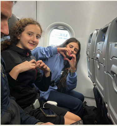
My sister and I flying to the United States last year