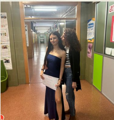
My mother and I after my graduation.