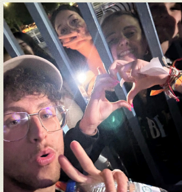
A photo with one of my favorite singers.