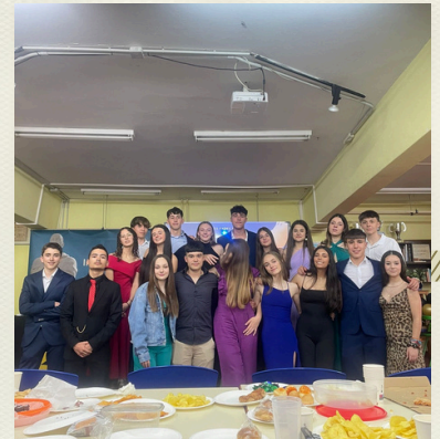
My class from last year at the ESO graduation.