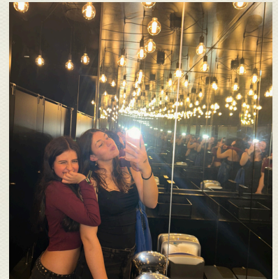
My friend and I at the graduation party.