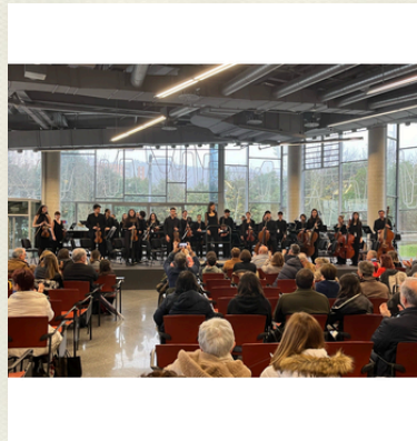
Me playing in my music orchestra.