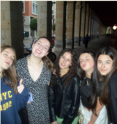
My friends and I going to in the city center.