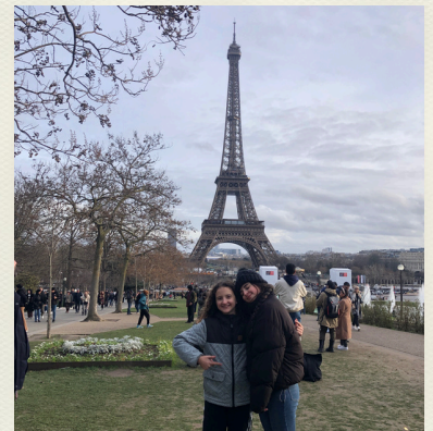
My sister and I in Paris.