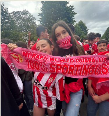
My friend and I cheering for my city's soccer team.