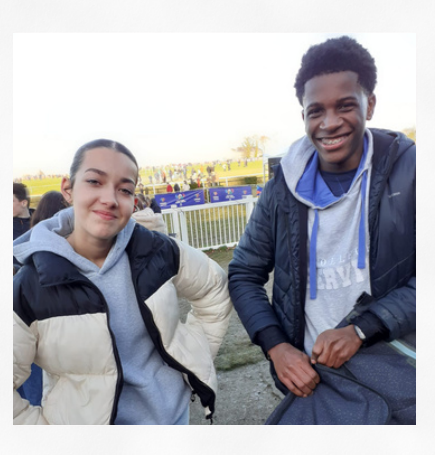
with my best friend