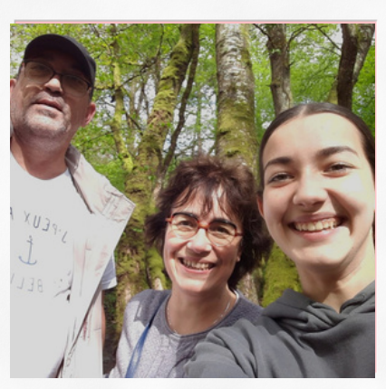
with my parents