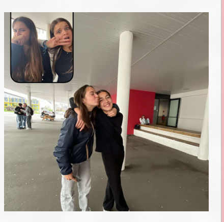
with my friends