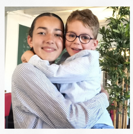
with my cousin