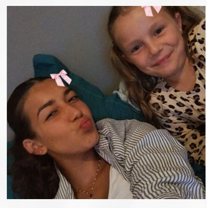
with my cousin