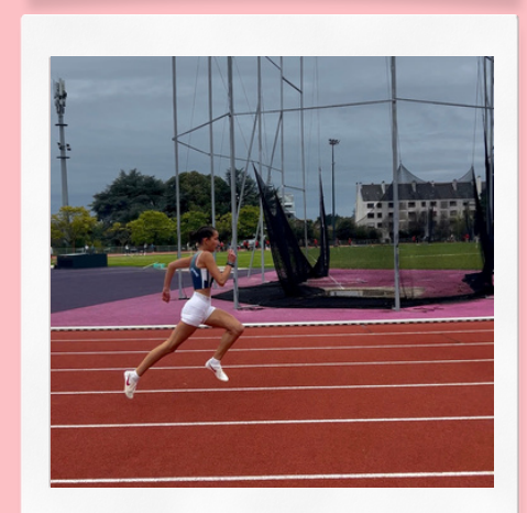
at athletic competition