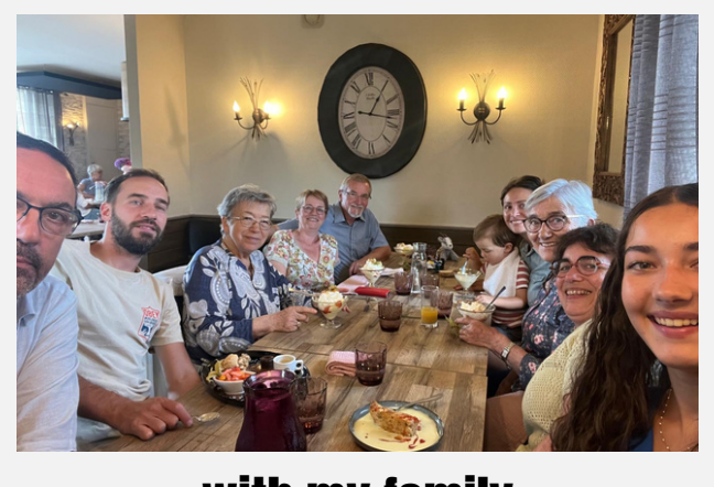
with my family