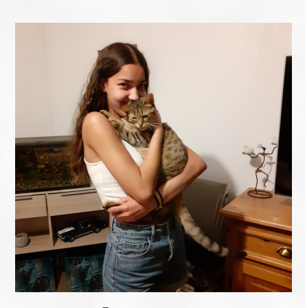
with my cat