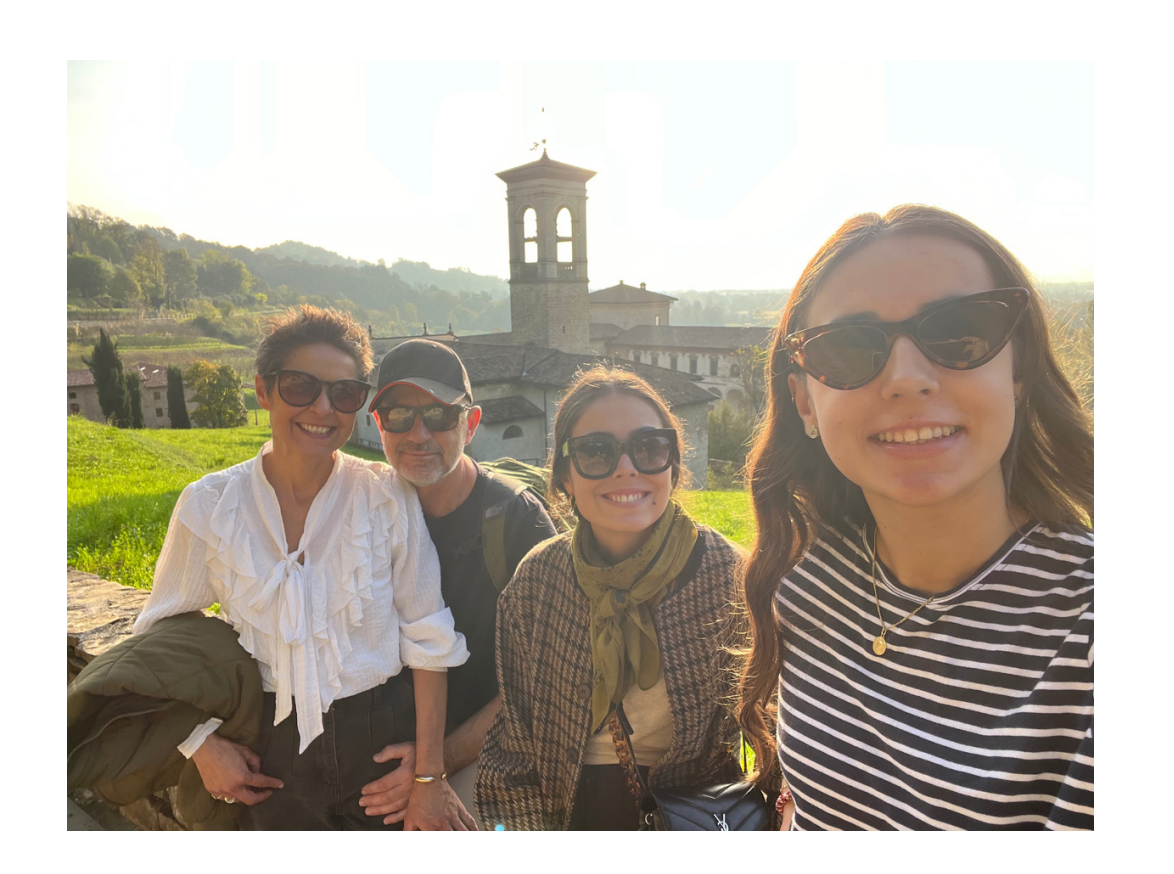
This picture is from our family trip in Italia. We love travelling and I love my family so combining both is amazing