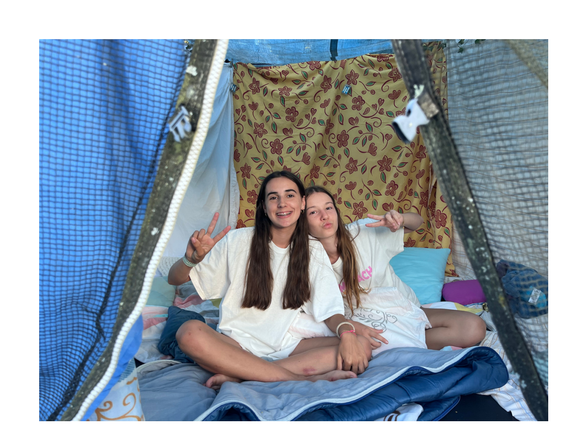
I had a trampoline sleepover with my cousin wich is also my best friend this summer, just like in videos we used to watch on YouTube