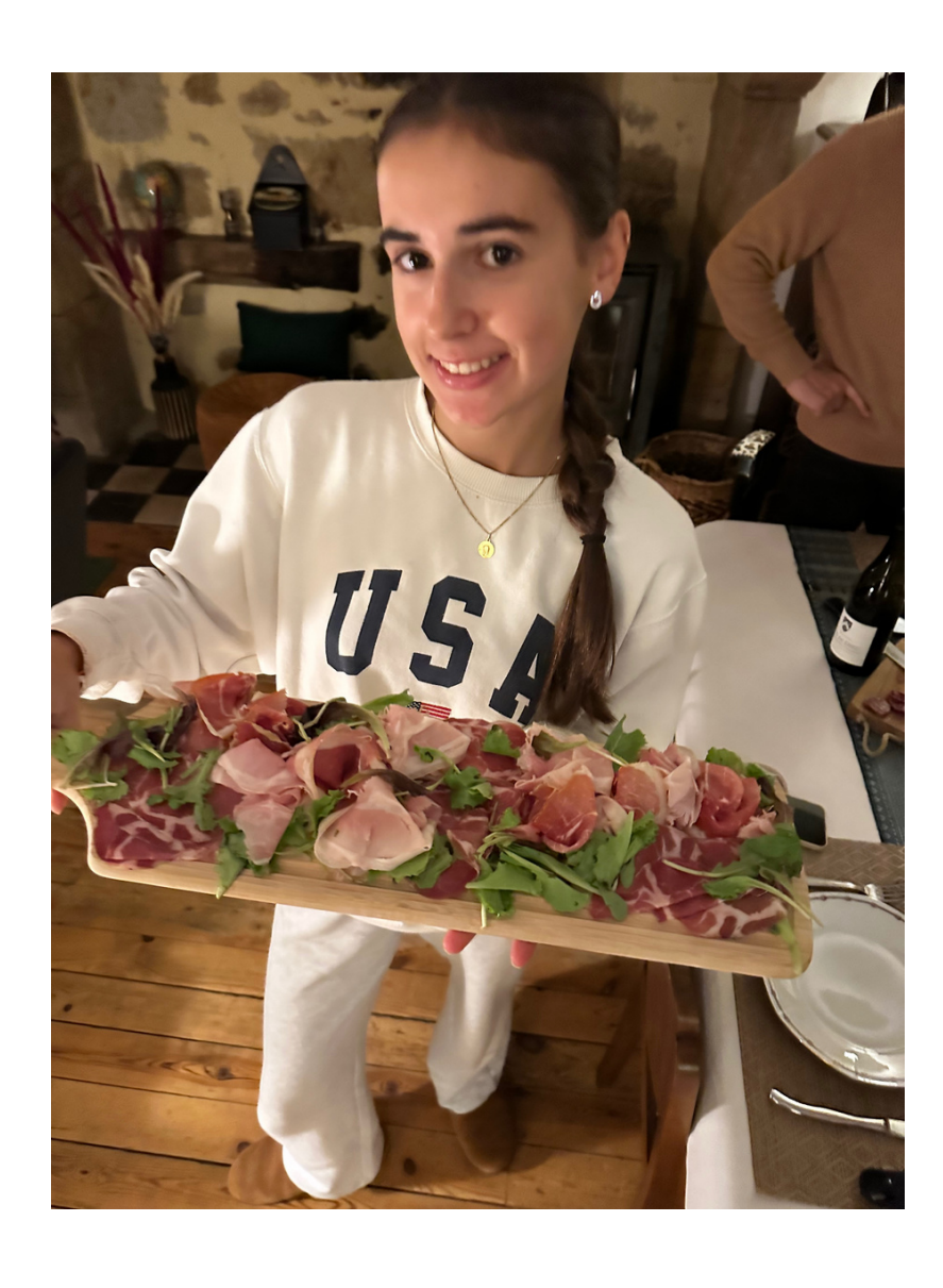
Right before a french dish called raclette: it's made of cheese and potatoes and it's amazing!