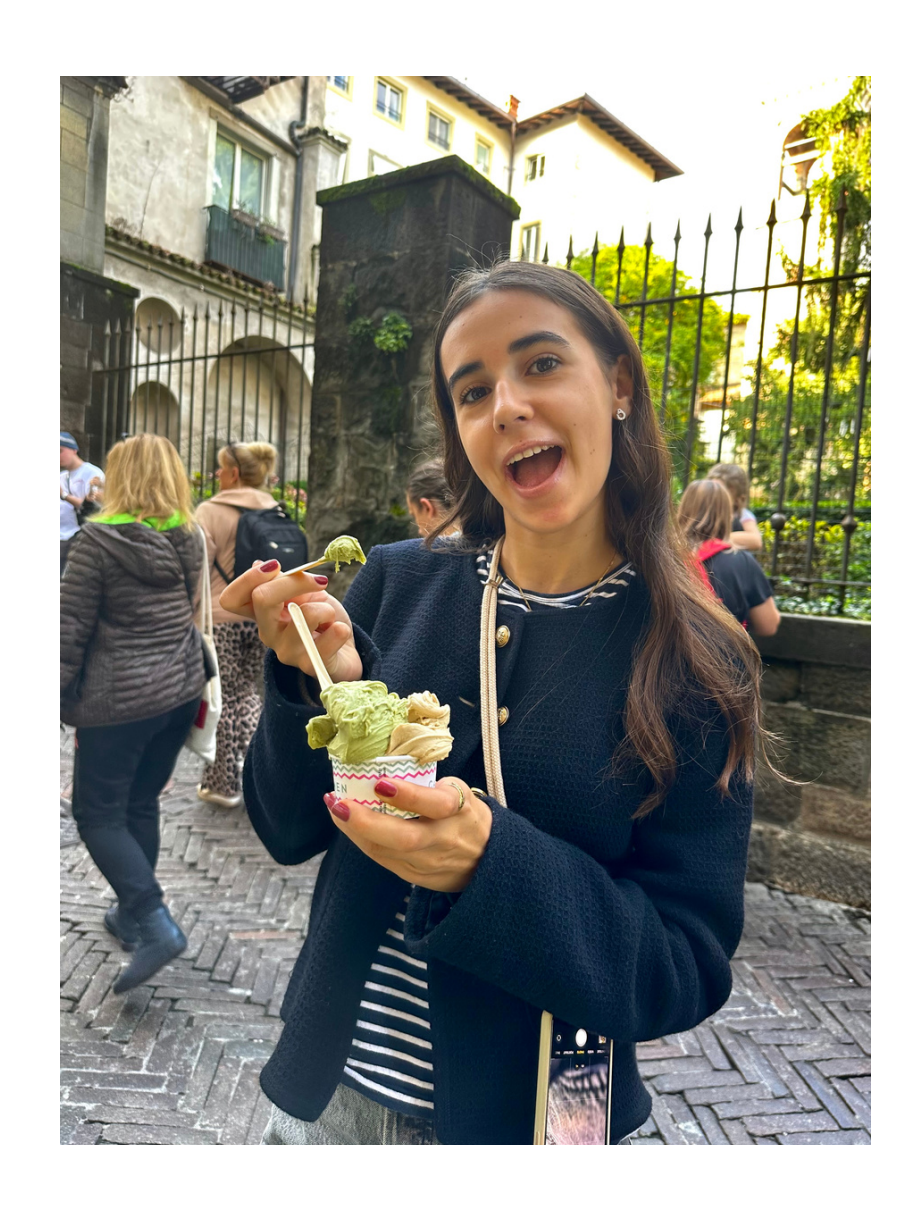
This was my first italian iced cream from our trip with my family and it was delicious