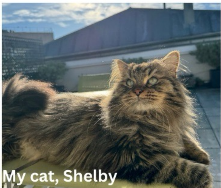
My cat, Shelby