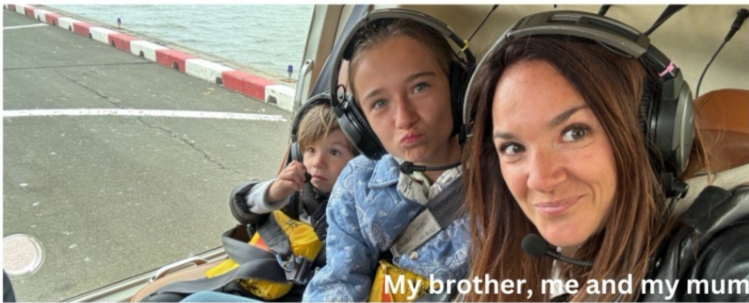
My brother, me and my mum