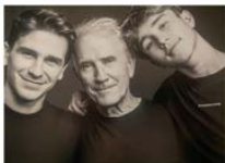
My father and my brother