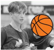
Basketball, my favorite hobby