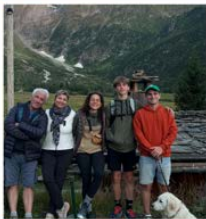
Our family holidays