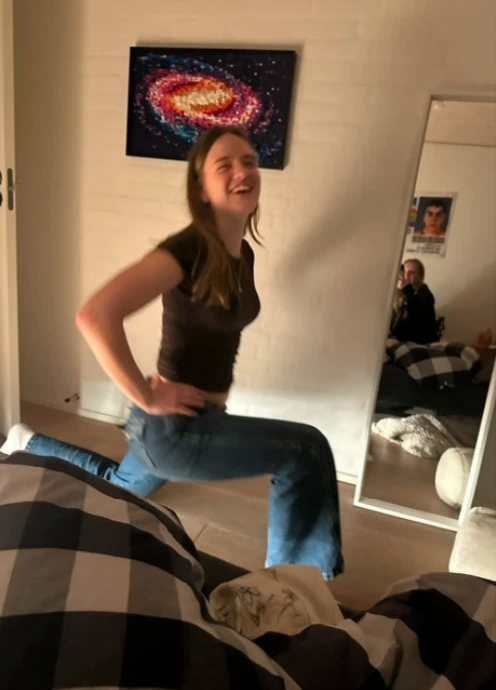
Wanted to prove to my best friend i could do the splits. (I couldn't)