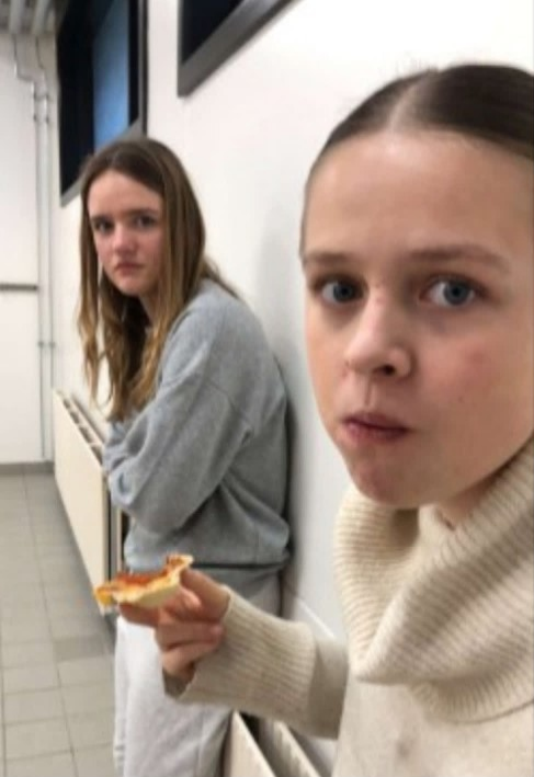
Getting ready for our last class of the day. Try and guess what it was based of our faces. (Hint: PE)