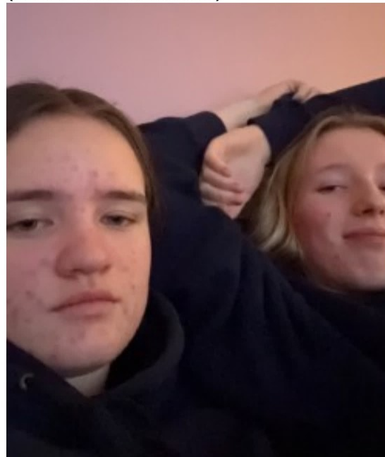
The morning after a sleepover, the morning after war, or just the morning all in all? (3 correct answers)