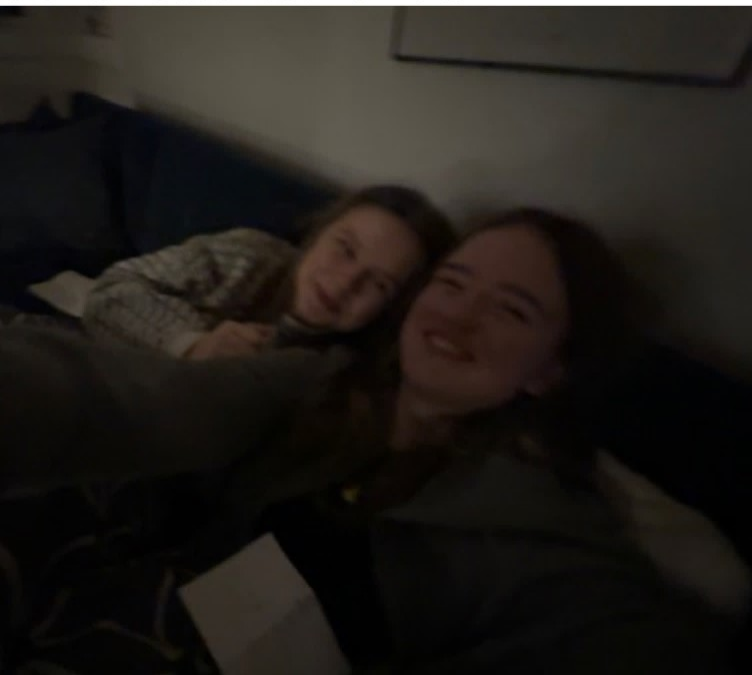
At my friends house doing karaoke home alone. We sounded horrible.