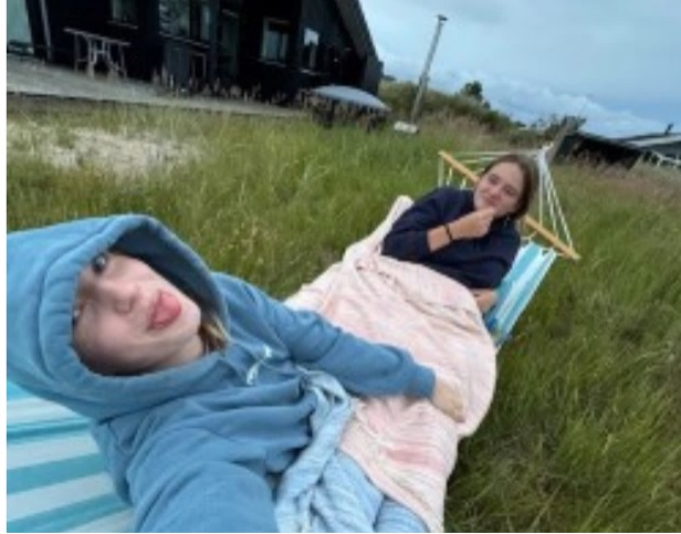
Nap in the hammock at the summerhouse with my best friend. (Most beautiful sentence ever)