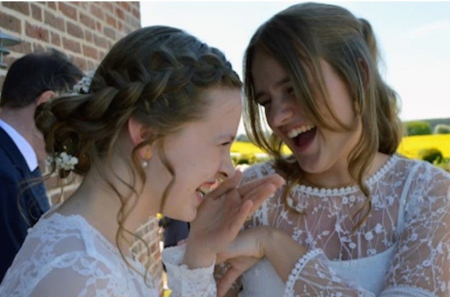
Some gossip with my friend before we got confirmed.