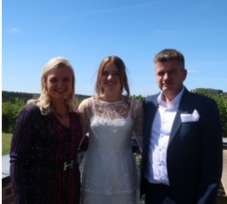
My parents and I on the day i got confirmed