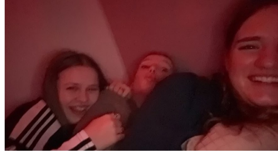
Woke up from a group nap by someone farting. We still haven't figured out who it was.