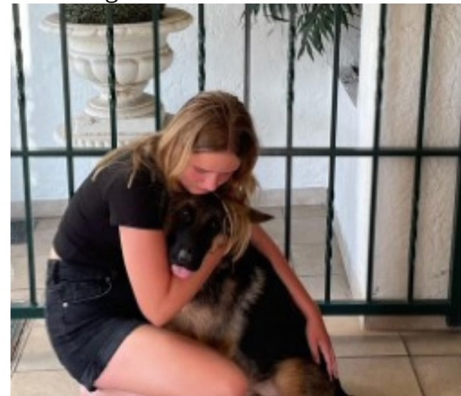
Me with one of my grandmas adorable dogs in the south of France. I love dogs so so much.