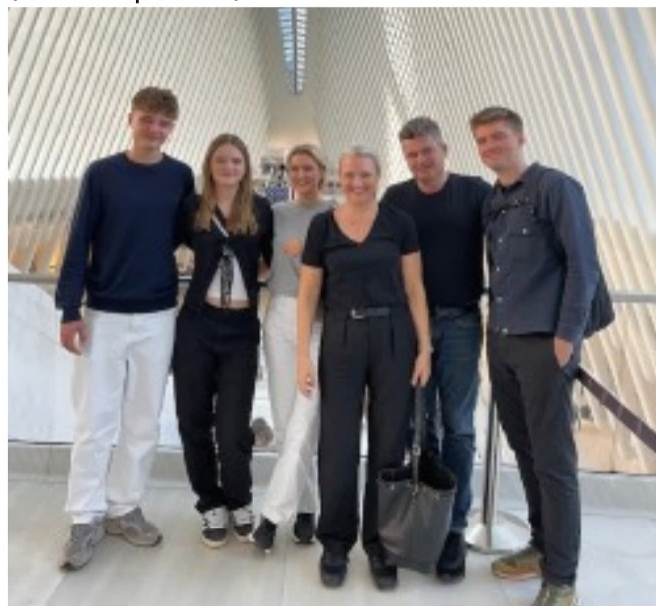
Family photo in New York (Best trip ever)