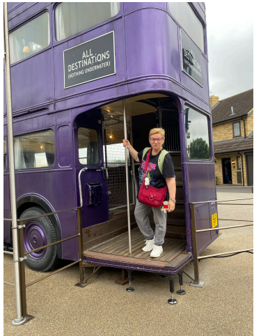
This is my mom who came with me at the Studios