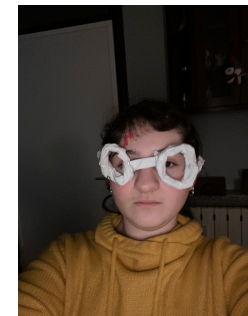
me as Harry Potter