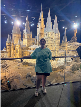
This is me at the Harry Potter Studios in London this year