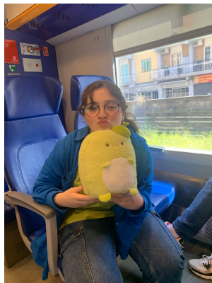
ma after buying this plushie. His name is Kabubi