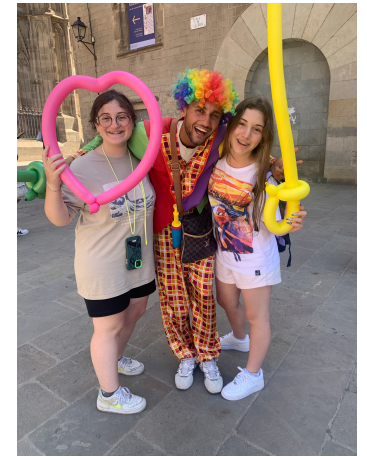
me, my sister and a guy in Spain that gave us cute balloons