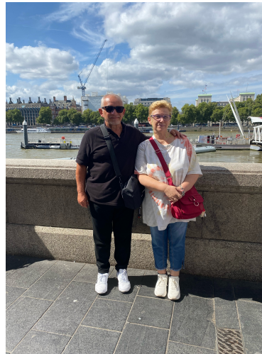
my parents in London