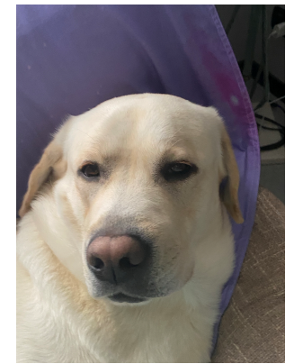
my dog again. Isn't he so cute?