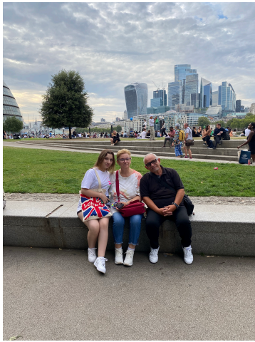
My parents and my sister in London.