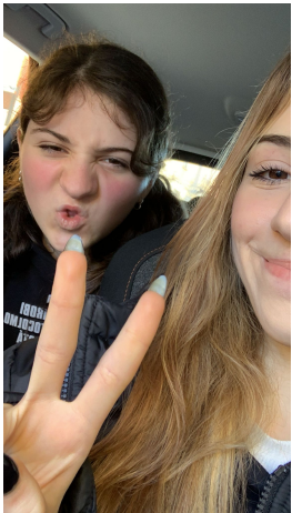
me and my sister