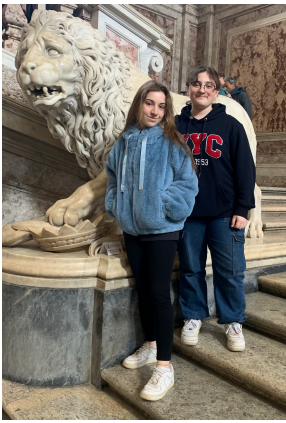
me and my sister at The "Reggia di Caserta", Caserta, Naples, Campania