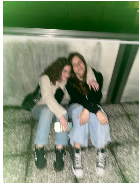
These are two of my friends at the party of the last day of school