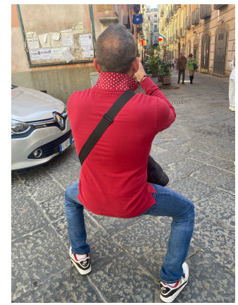
my godfather taking a picture in a weird position