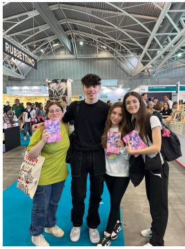
me, my sister and one of our friends together with an author we met at the "Salone del Libro" in Turin