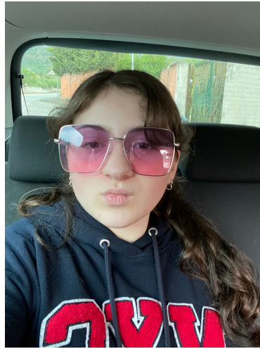
This is me trying my sister's sunglasses