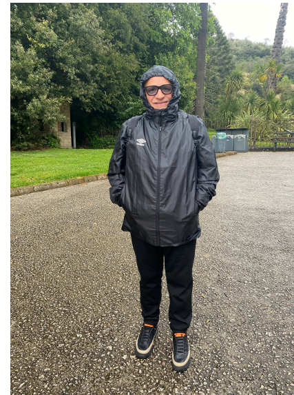
My dad in his raincoat