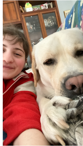
me playing with my cuteeeee dog