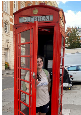
me inside of a telephone box in London