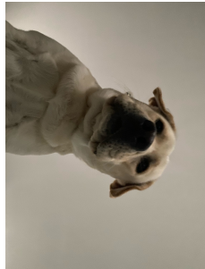
still my dog