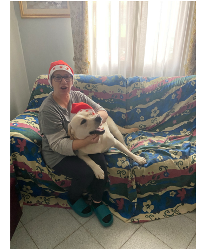
my mother with my my dog wearing Christmas hats