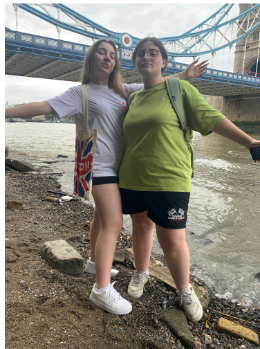
me and my sister near the Tower Bridge in London