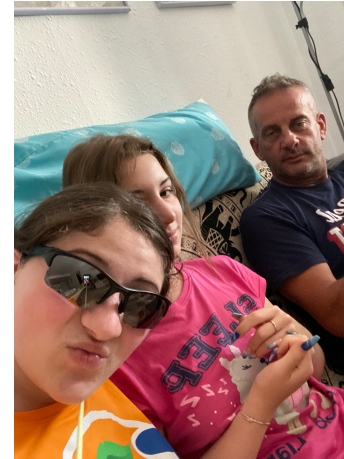
me, my sister and my godfather taking funny pictures