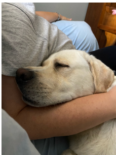
my dog Axel