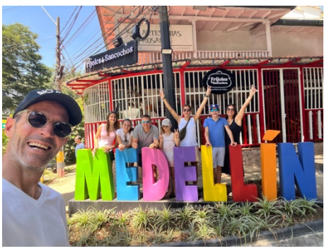
Medellin (Colombia) – Family trip