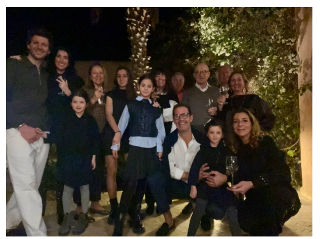
Essaouira - with my family