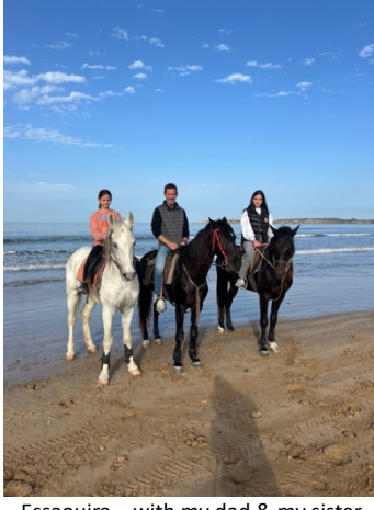
Essaouira – with my dad & my sister