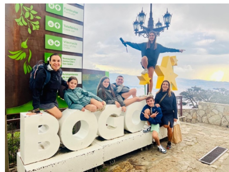
Bogota (Colombia) – Family trip

In a few days, I will go skiing with my parents & my sister. ≯