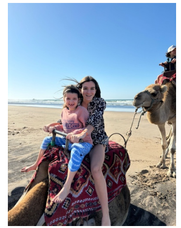
Essaouira - with my little cousin