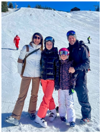
Switzerland – Feb 2024