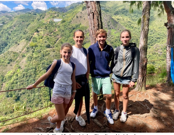
Medellin (Colombia) – Zip line (1,4 km)