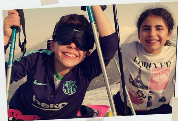
with my brother