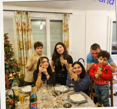
with my cousins