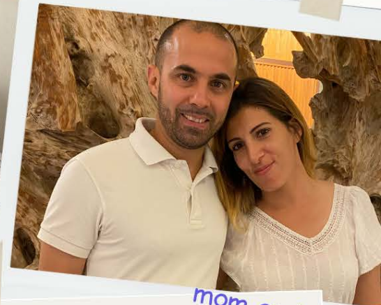
mom and dad