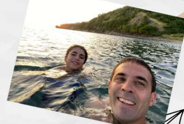
Me and my dad