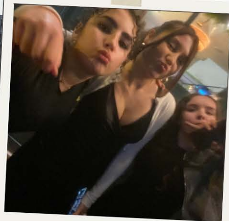
with my bestfriends