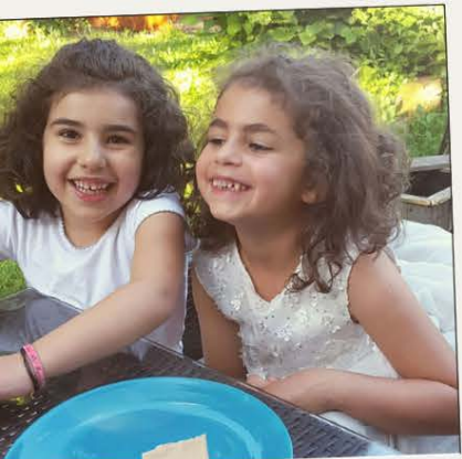
with my family