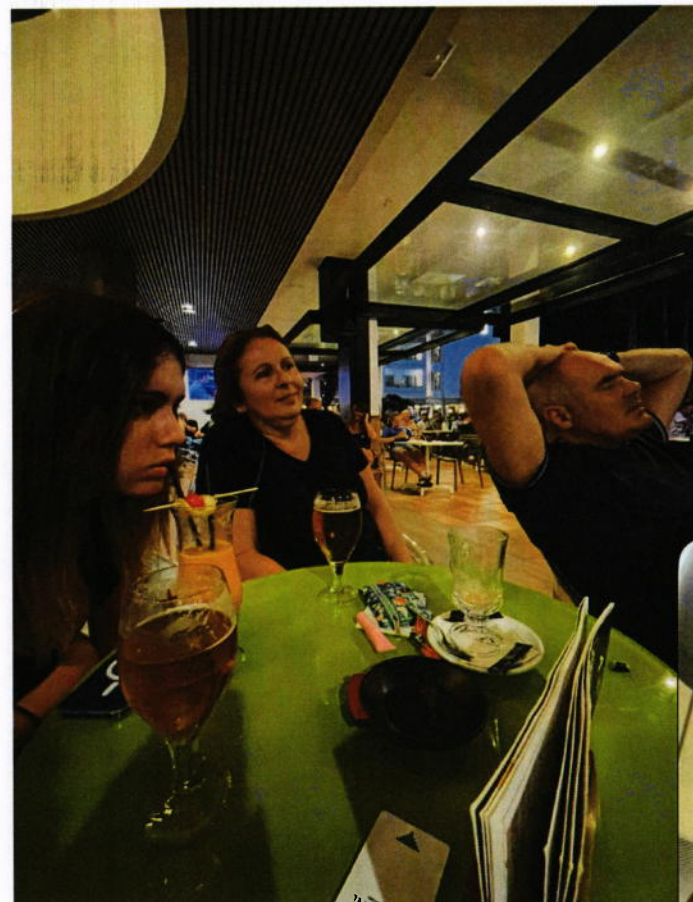
Watching football with my parents, on holidays