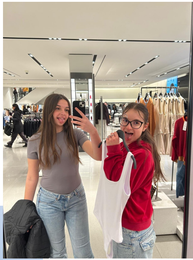
Me with my best friend