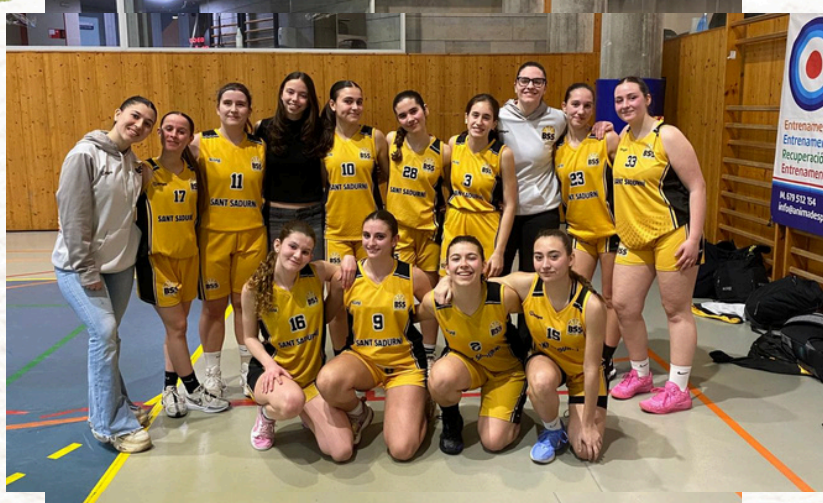
This is my basketball team and I'm number 10.