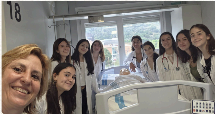
Here is one of the hospitals that I went to with the program that I told you about in the letter. In the picture at the top is my group of friends, and in the second one is the whole group. In both of them you can see the doctor; she is the blonde lady. Here we did internal medicine, and it was very interesting.