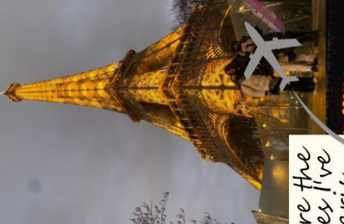
These were the best places I've been: Paris, London, Ireland, Ibiza...