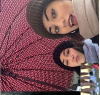
In all these photos I'm with my best friends