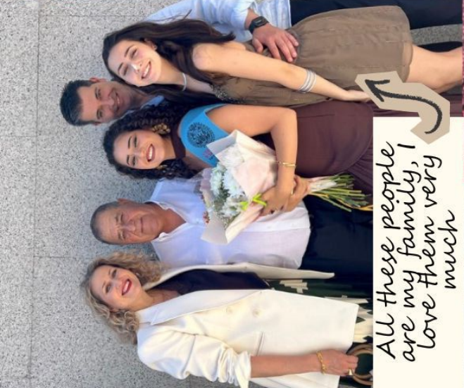
All these people are my family, I love them very much