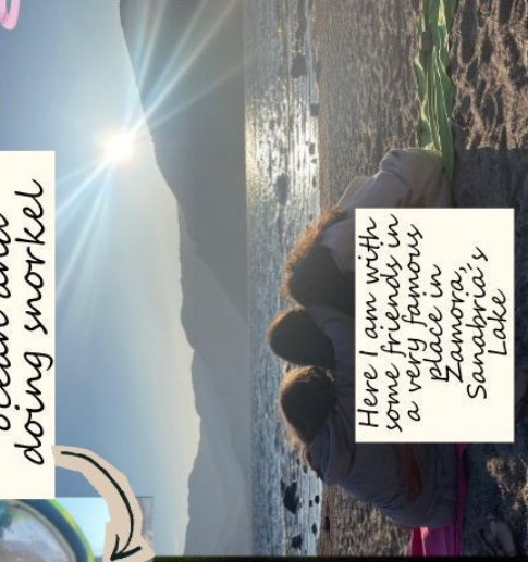
Here I am with some friends in a very famous place in Zamora, Sanabria's Lake