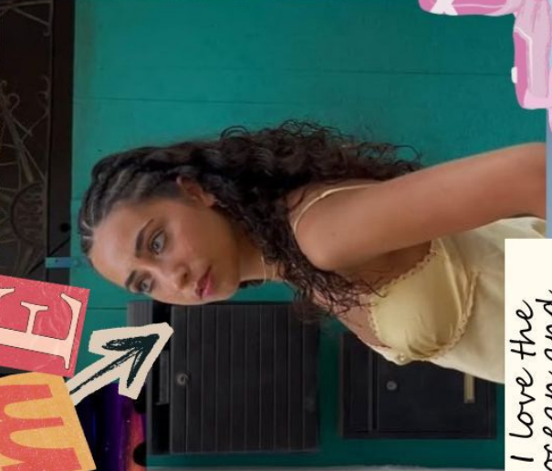
I love the ocean and doing snorkel