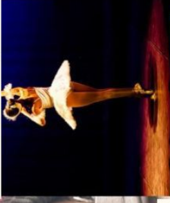
Me doing what I love the most, ballet